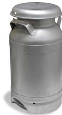
5 Gallon Milk Can Item #60224