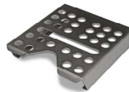
Platform for bag-in-box Item #63959