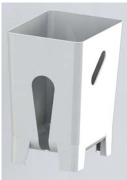
Milk Crate for 3, 5, or 6 Gallon bags Item #35904