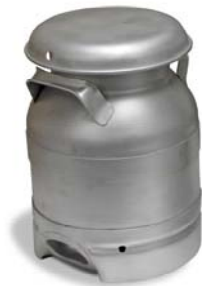
3 Gallon Milk Can Item #62642